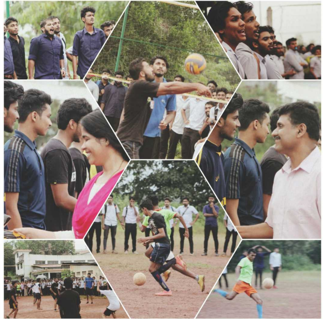
Highlights of intramural matches