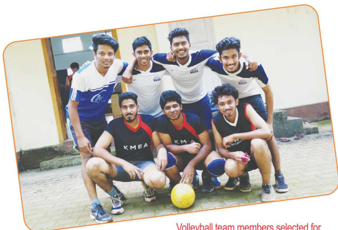
Volleyball team members selected for K T U D-zone intercollegiate Tournament