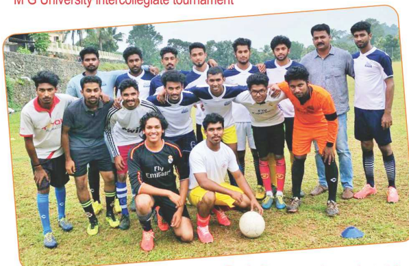
Football team members selected for M G University intercollegiate tournament