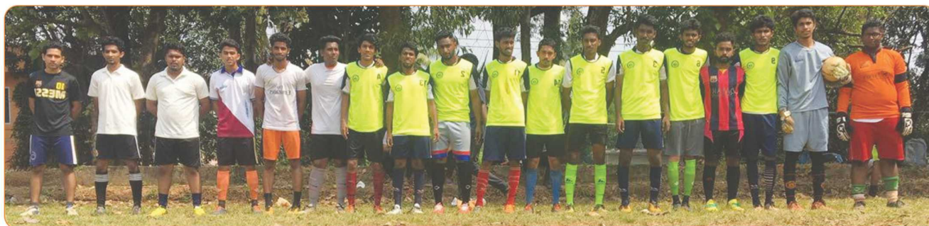
Football team members selected for K T U D-zone intercollegiate Tournament