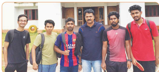
Table tennis team members selected for M G University intercollegiate tournament