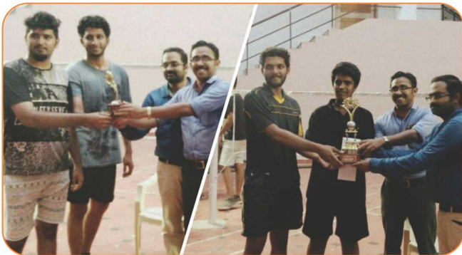
Winners and Runners-up in intramural badminton tournament