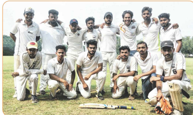
Cricket team members selected for M G University intercollegiate tournament