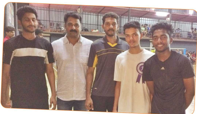
Badminton team members selected for M G University intercollegiate tournament