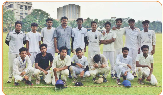
Cricket team members selected for K T U D-zone intercollegiate tournament