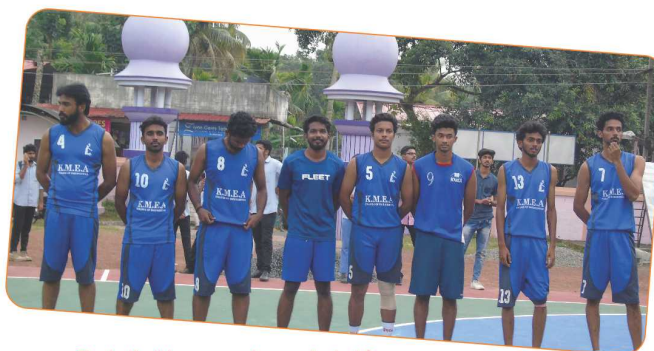
Basketball team members selected for M G University intercollegiate tournament